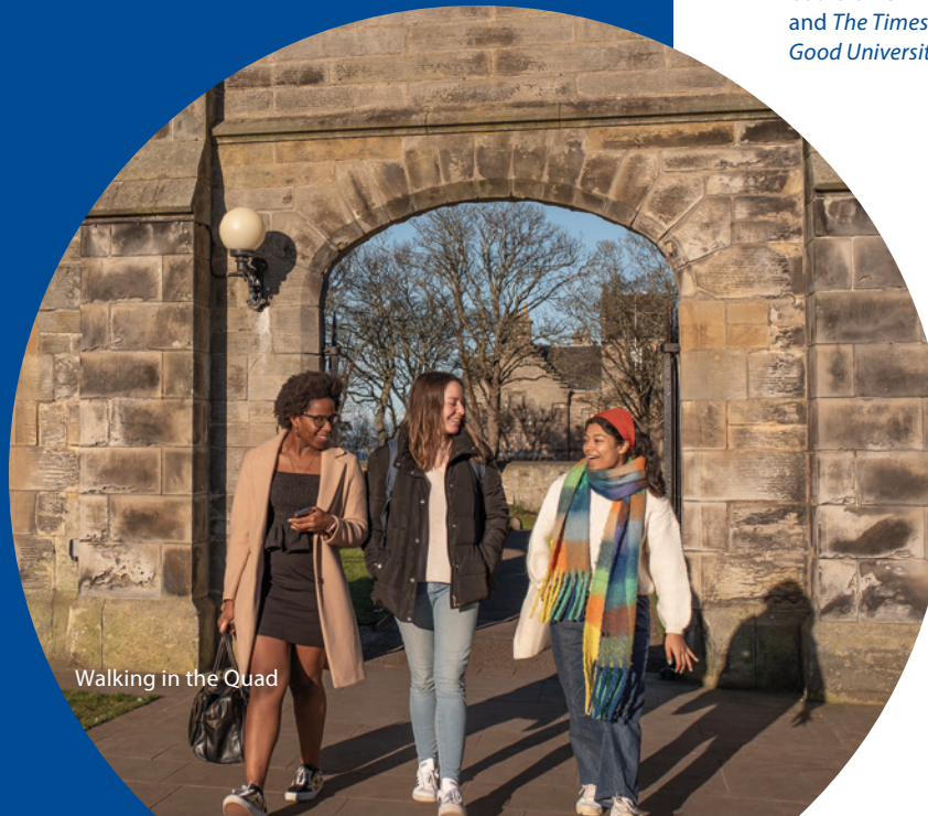
Walking in the Quad

Email: keb32@st-andrews.ac.uk Telephone: +44 (0)1334 462105