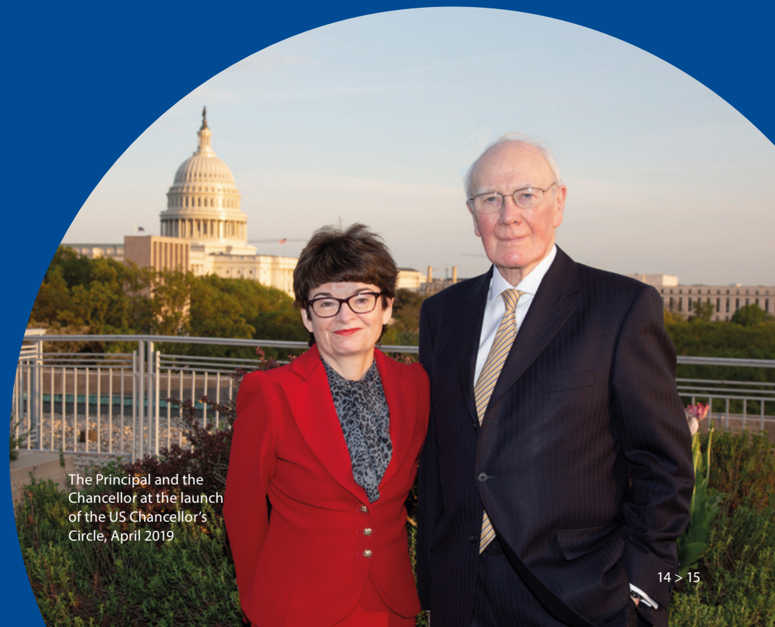
The Principal and the Chancellor at the launch of the US Chancellor's Circle, April 2019

All members of the Chancellor's Circle receive regular donor communications and an invitation to these events.