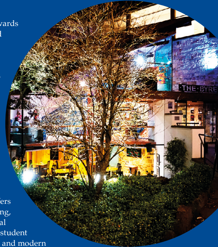
The Byre at night

It is currently developing some key projects to create greater connection between the University, the programme of events and the local community – including the St Andrews Film Festival, St Andrews Playwriting Award and an engagement project taking arts into schools and the local community.