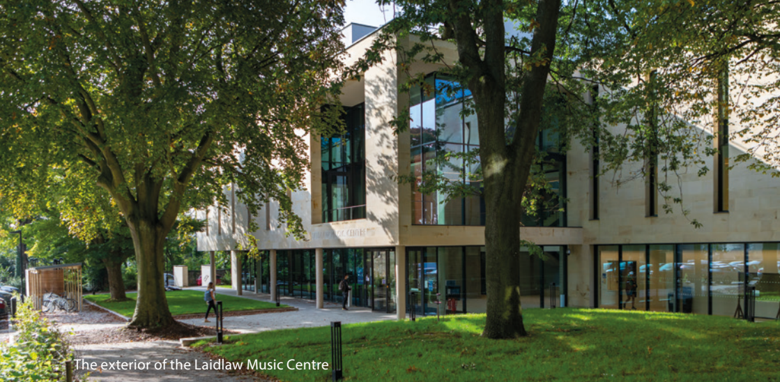
The exterior of the Laidlaw Music Centre