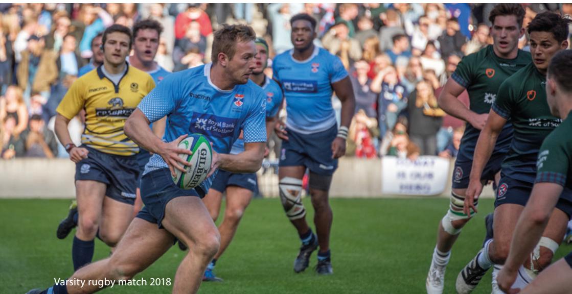
Varsity rugby match 2018