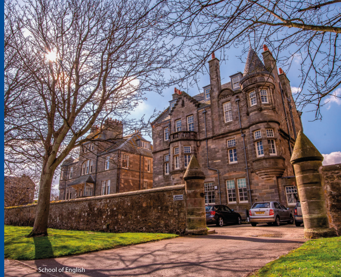
School of English