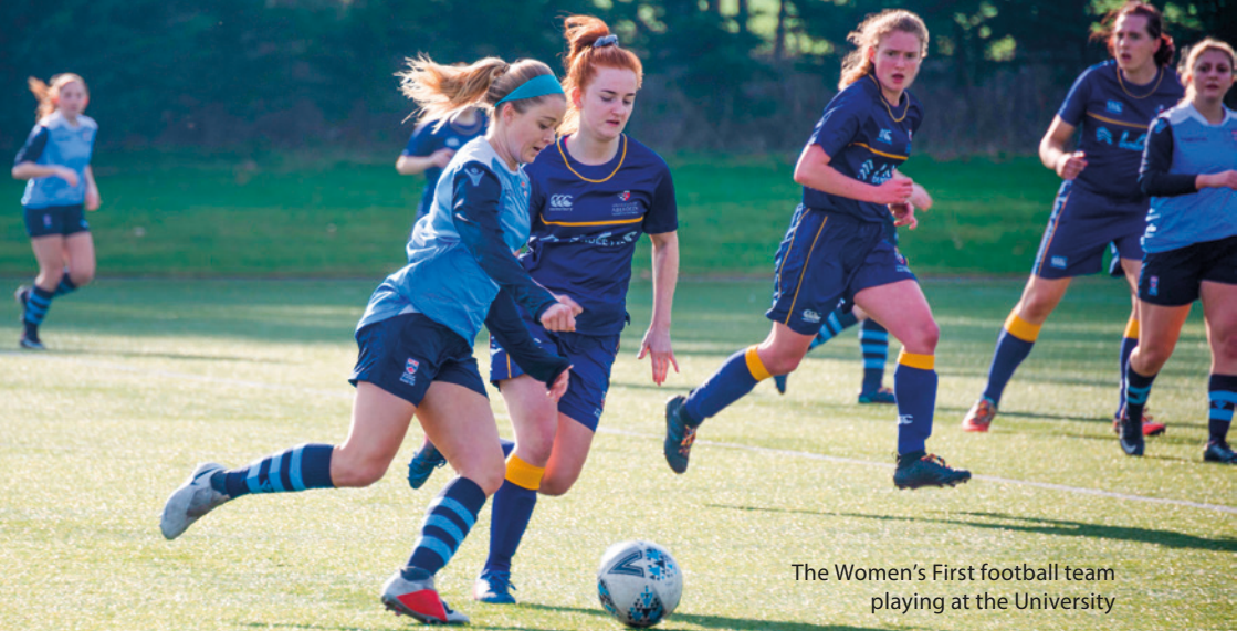
The Women's First football team playing at the University