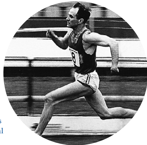
The Chancellor, The Rt Hon Lord Campbell of Pittenweem, ran the 200 metres for the GB team at the 1964 Tokyo Olympics

Today, sport continues to play a significant part in student life, and we have one of the highest participation rates of any university in the UK. The University’s commitment to making sport a central part of the student experience has resulted in an investment in both sporting infrastructure and highly qualified specialist staff.