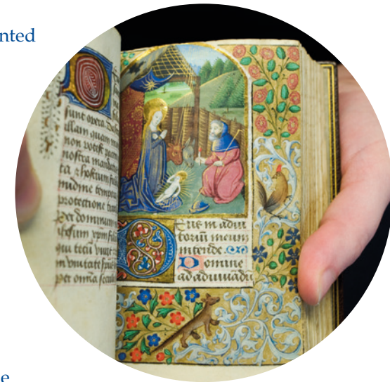
Book of Hours

At St Andrews we are unusual in that we offer access to the oldest and most valuable materials in our Libraries. These range from manuscripts, print materials and photographs to maps and music. The oldest item in the collection is a Greek papyrus dating from the first century AD.