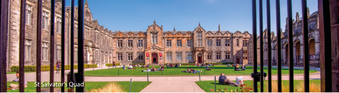
St Salvator's Quad