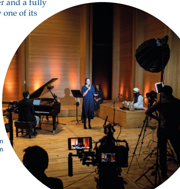
A concert being live-streamed from the McPherson Recital Room

This ‘jewel of a building’ – as it has been described – will be used for music making by the University community, the local community and visiting professional musicians from all over the world for many years to come.