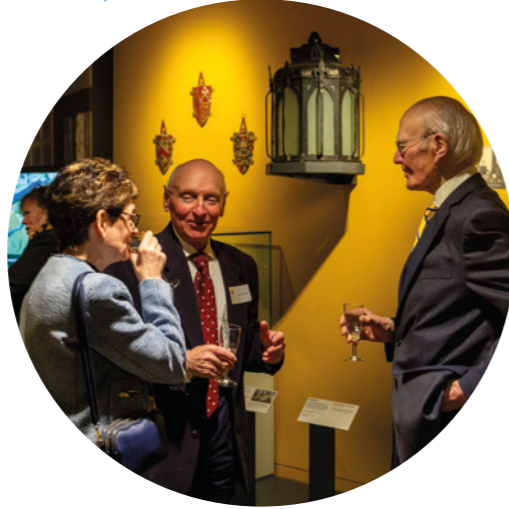
The Chancellor's Circle event in October 2023

The Rt Hon Lord Campbell of Pittenweem CH CBE QC President, the Chancellor's Circle