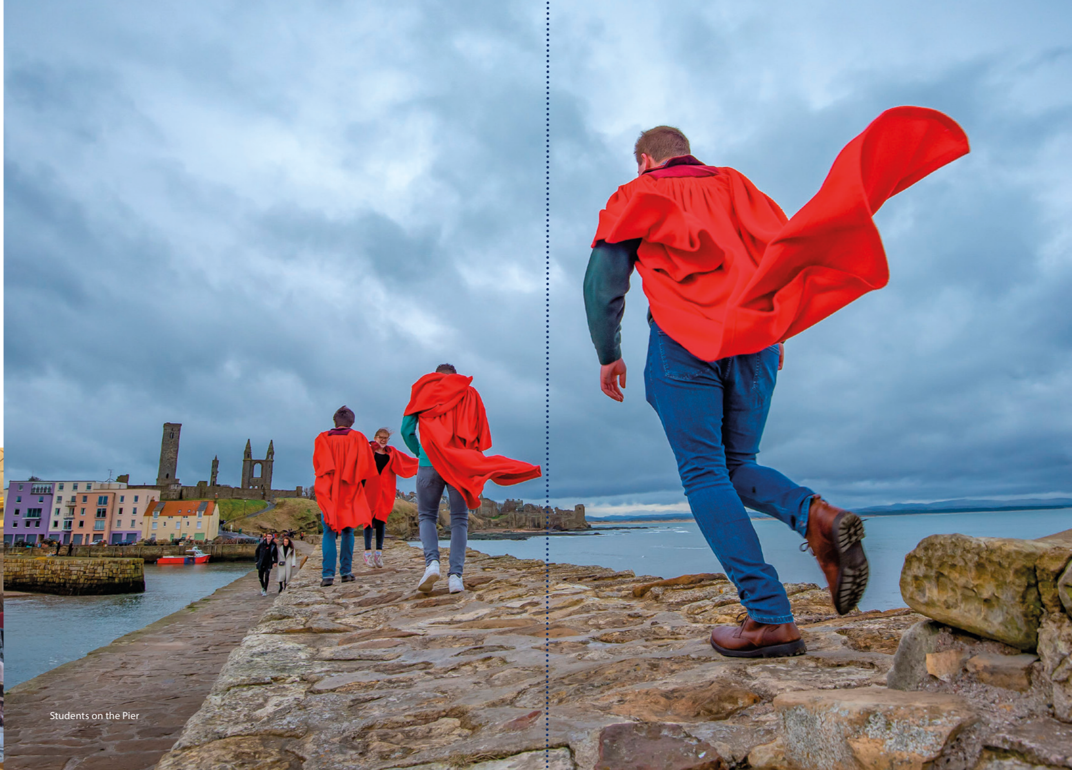
Students on the Pier