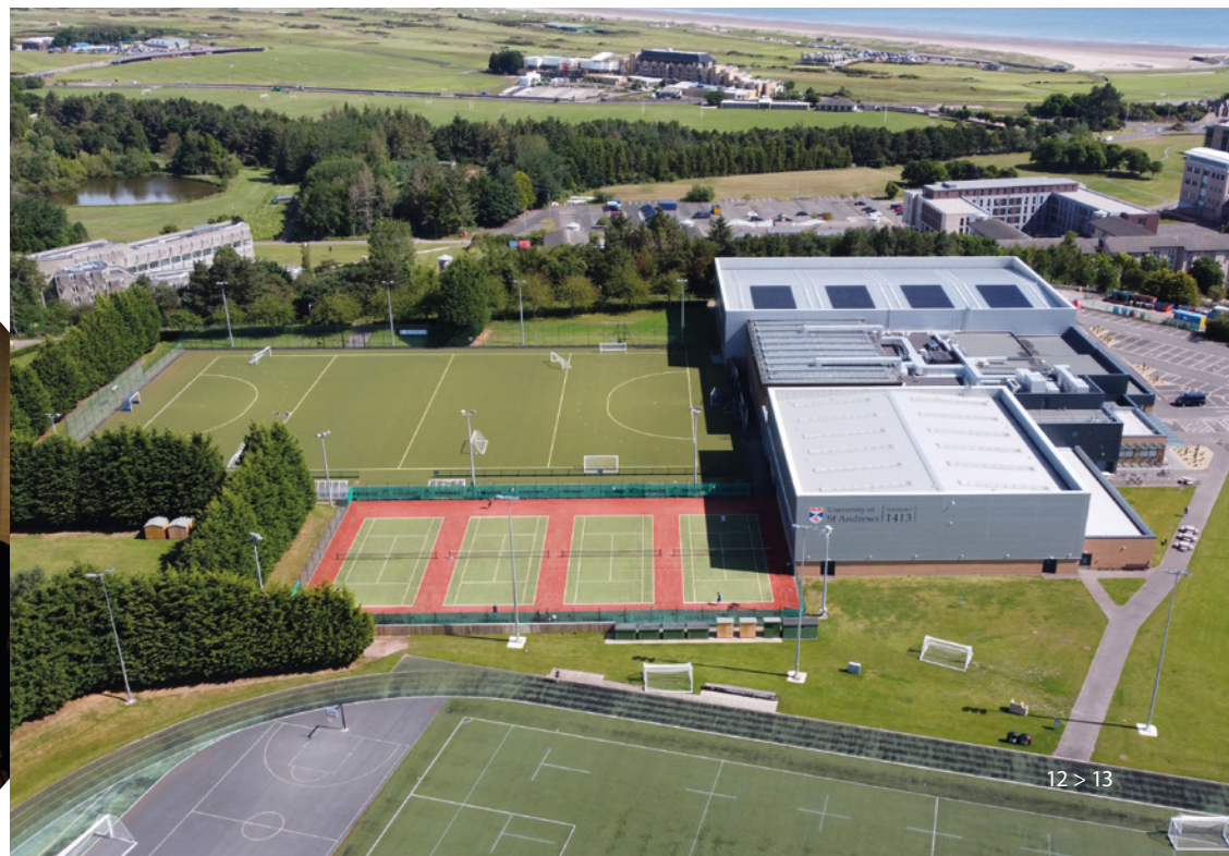
Bird’s eye view of the redeveloped Sports Centre.