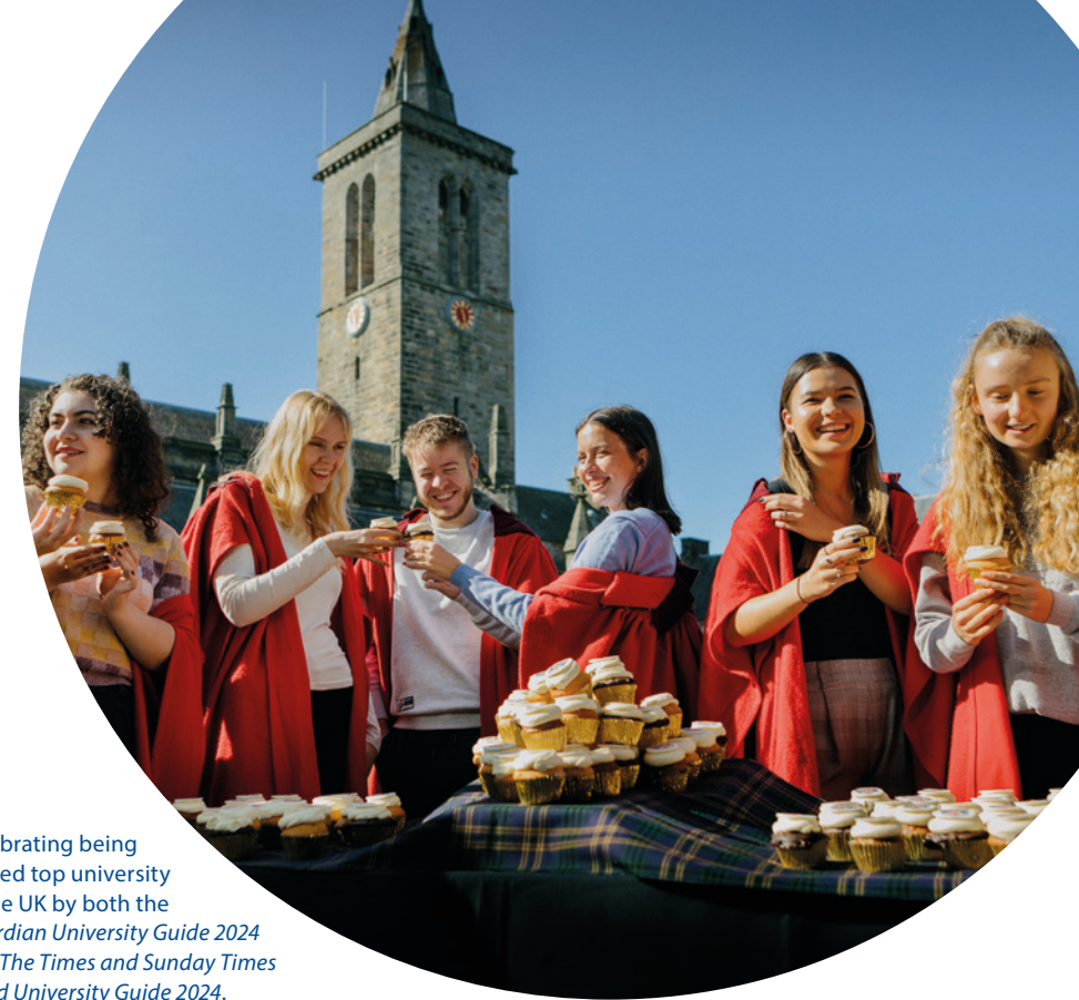
Celebrating being ranked top university in the UK by both the Guardian University Guide 2024 and The Times and Sunday Times Good University Guide 2024 .